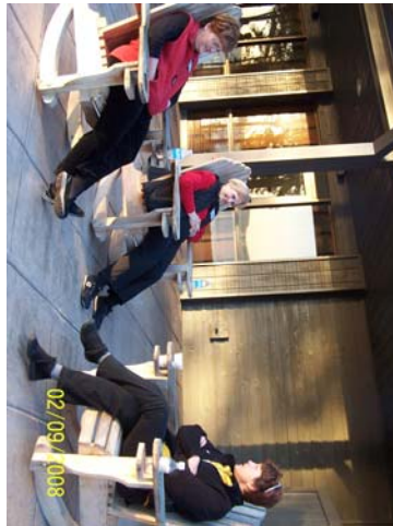
Relaxing with Friends