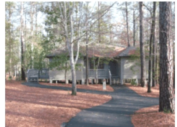
The Cottages Callaway Gardens Pine Mountain, Georgia